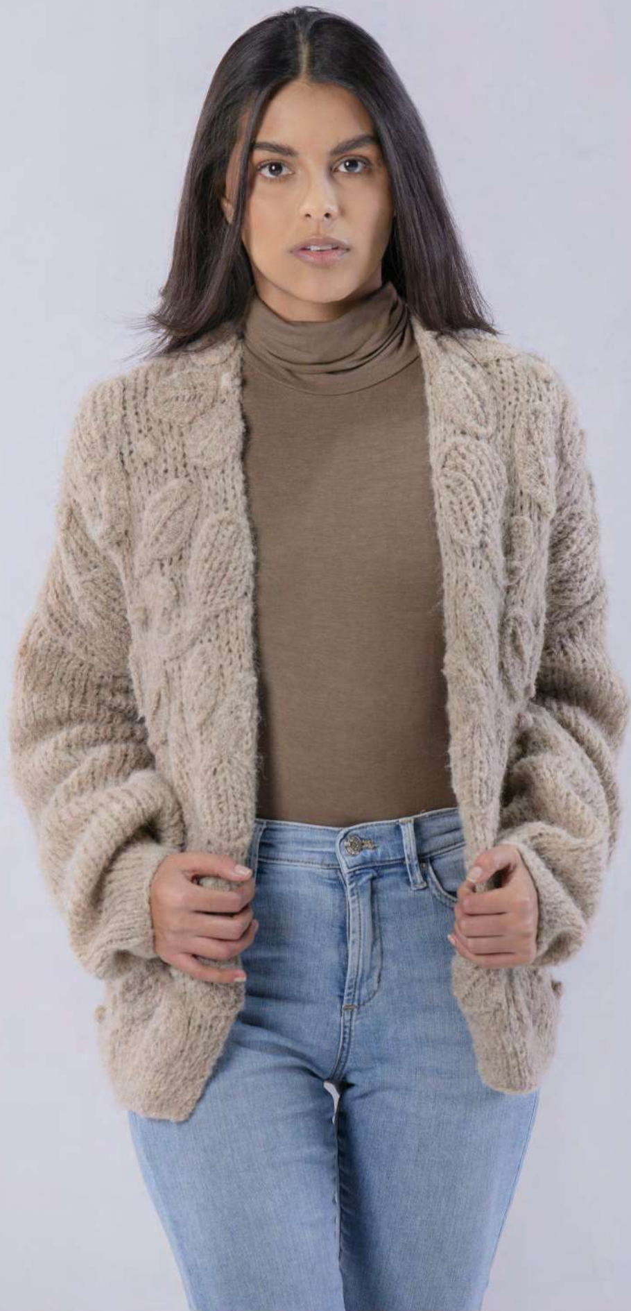
Cardigan SAHARA PM2232