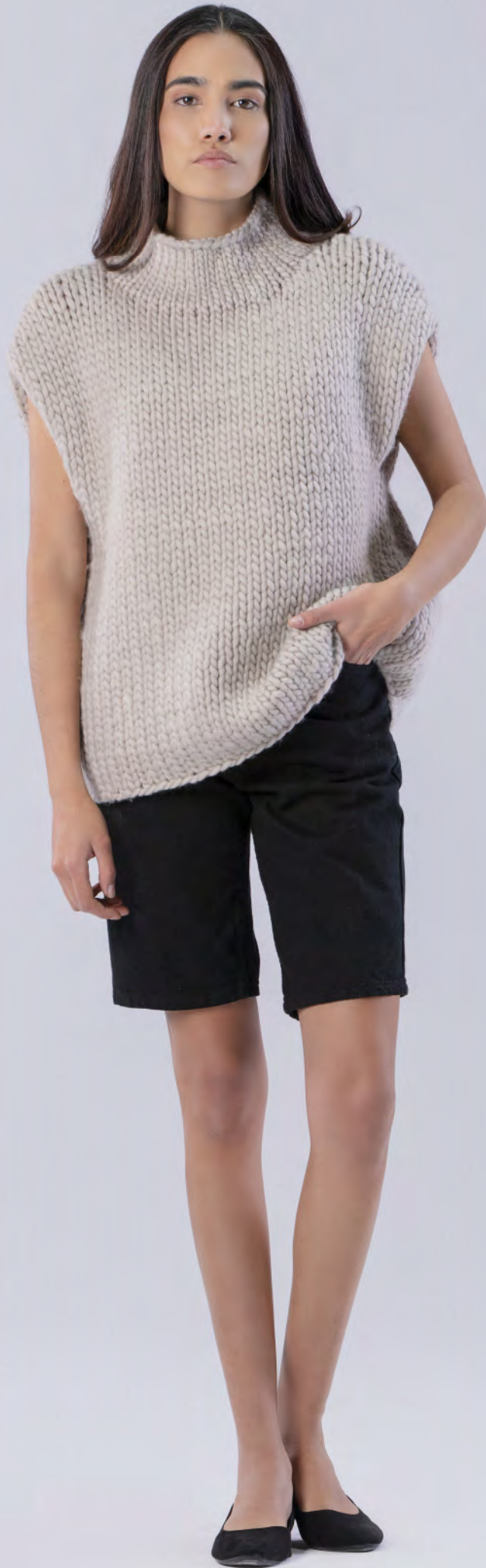
Vest MARA PM2231