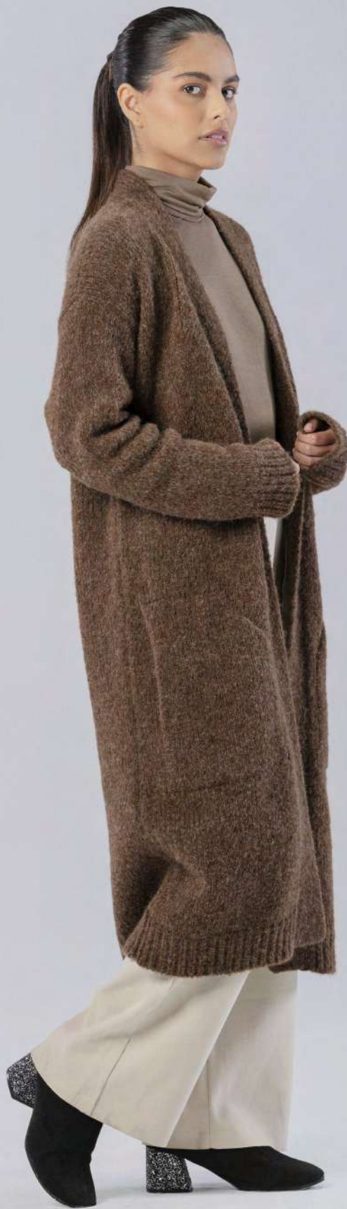
Long Cardigan CAROLINE PM2218