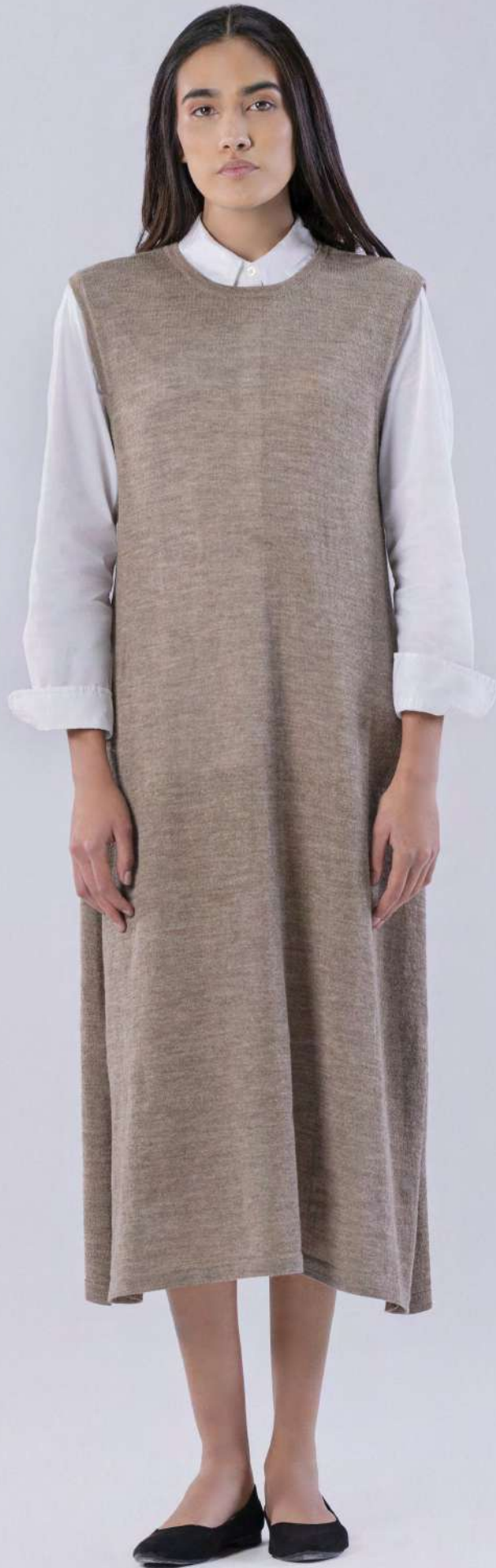
Dress LARISSA PM2230