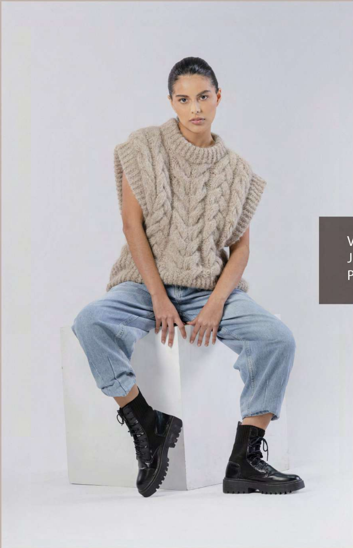
Vest JEANNE PM2221