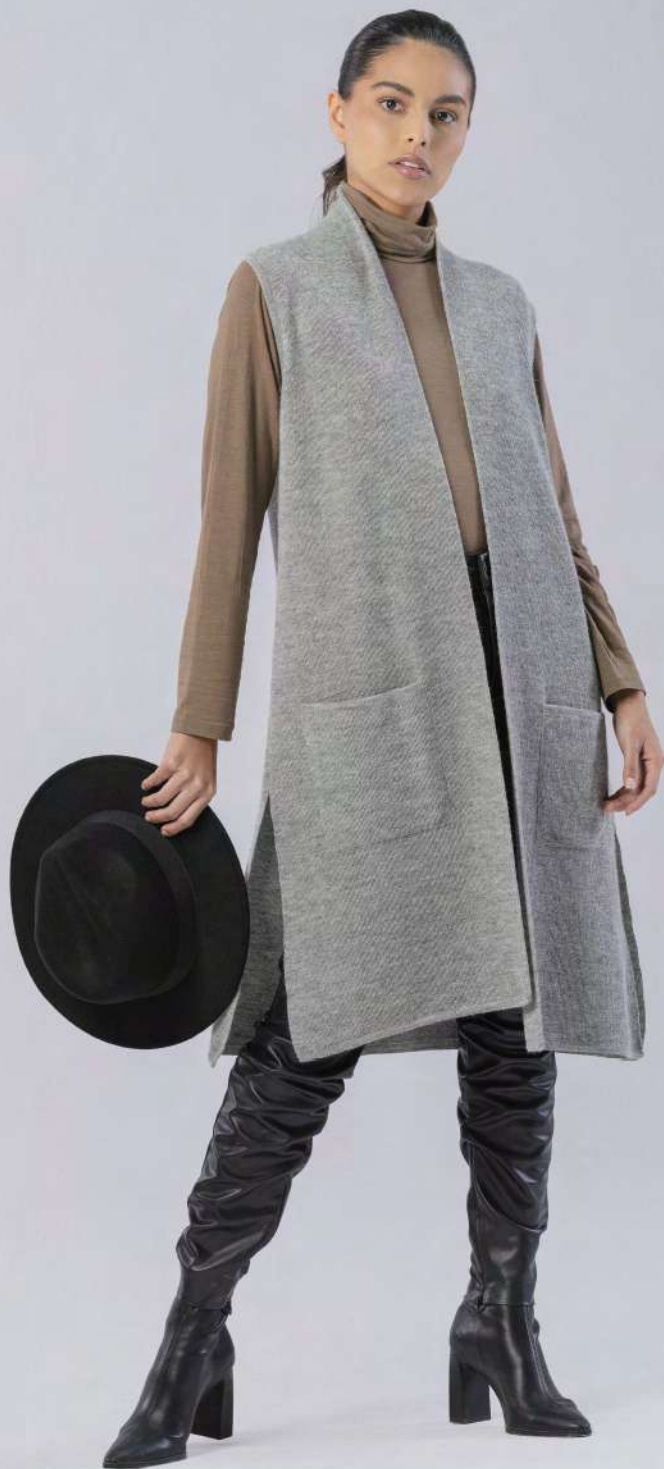
Vest DESSIRE PM2205