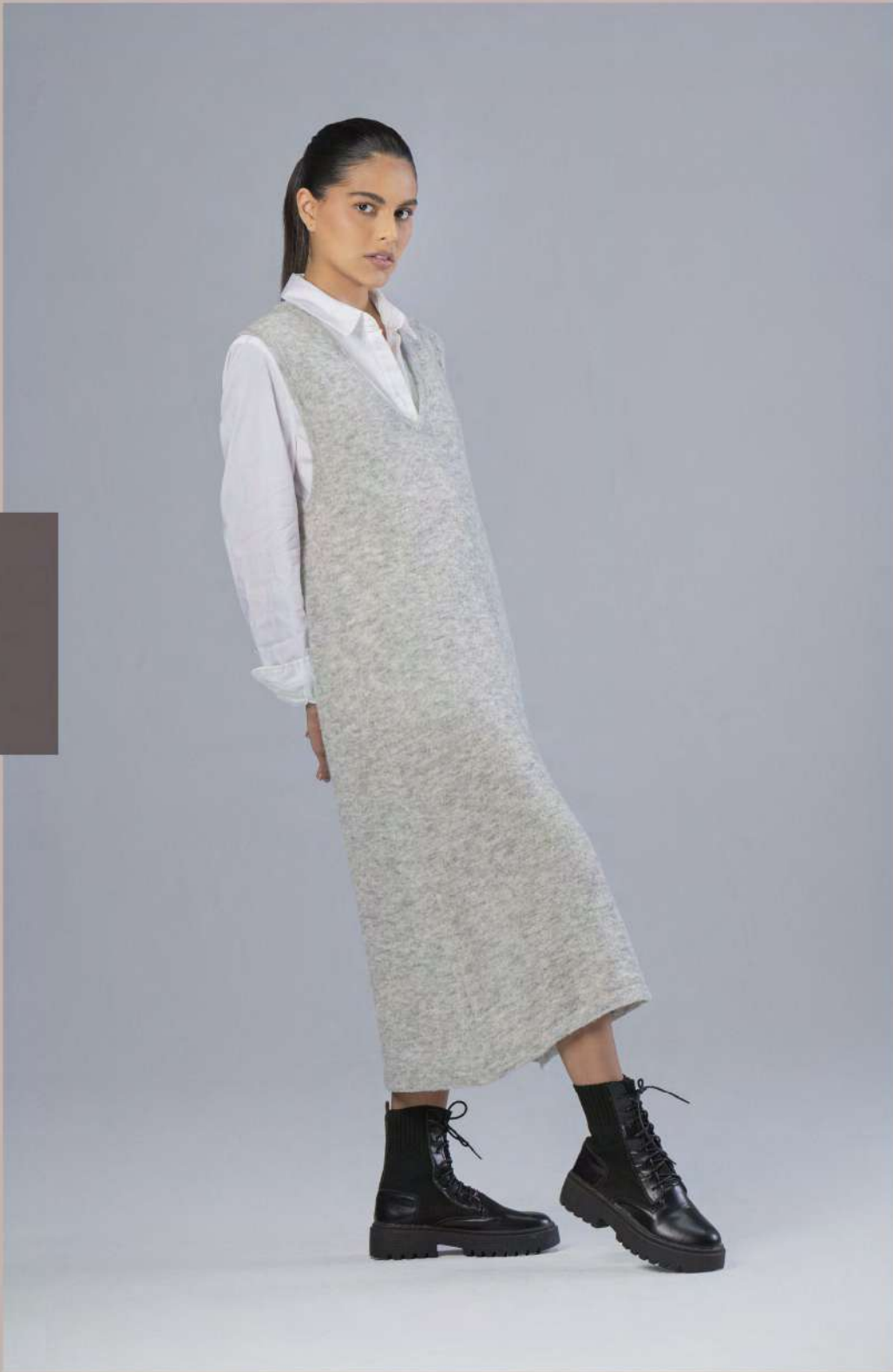
Dress SARALLY PM2208