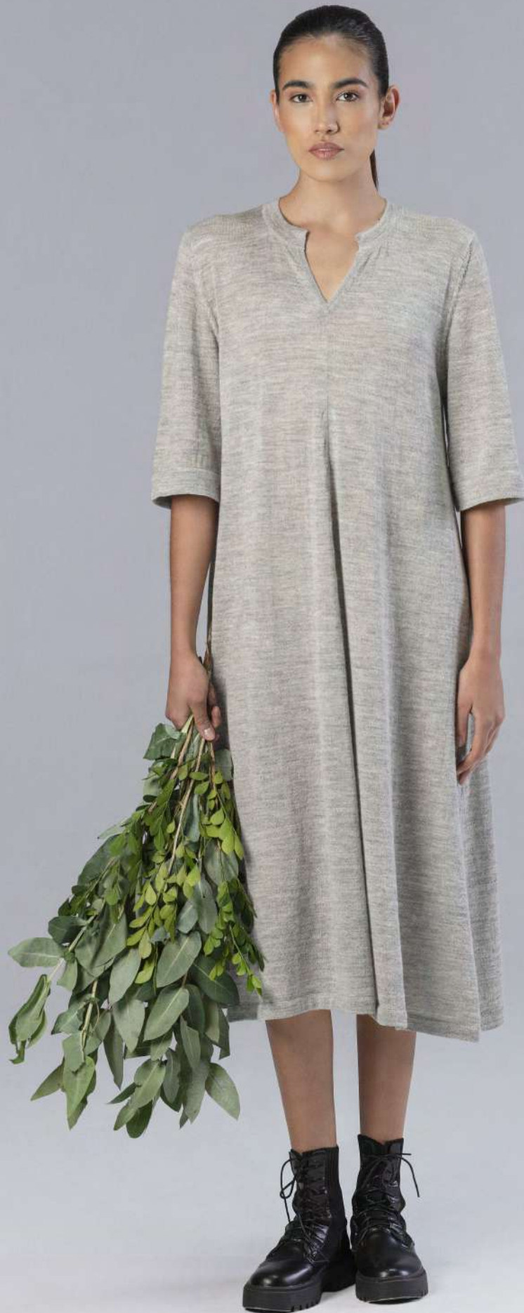
Dress KHALA PM2201