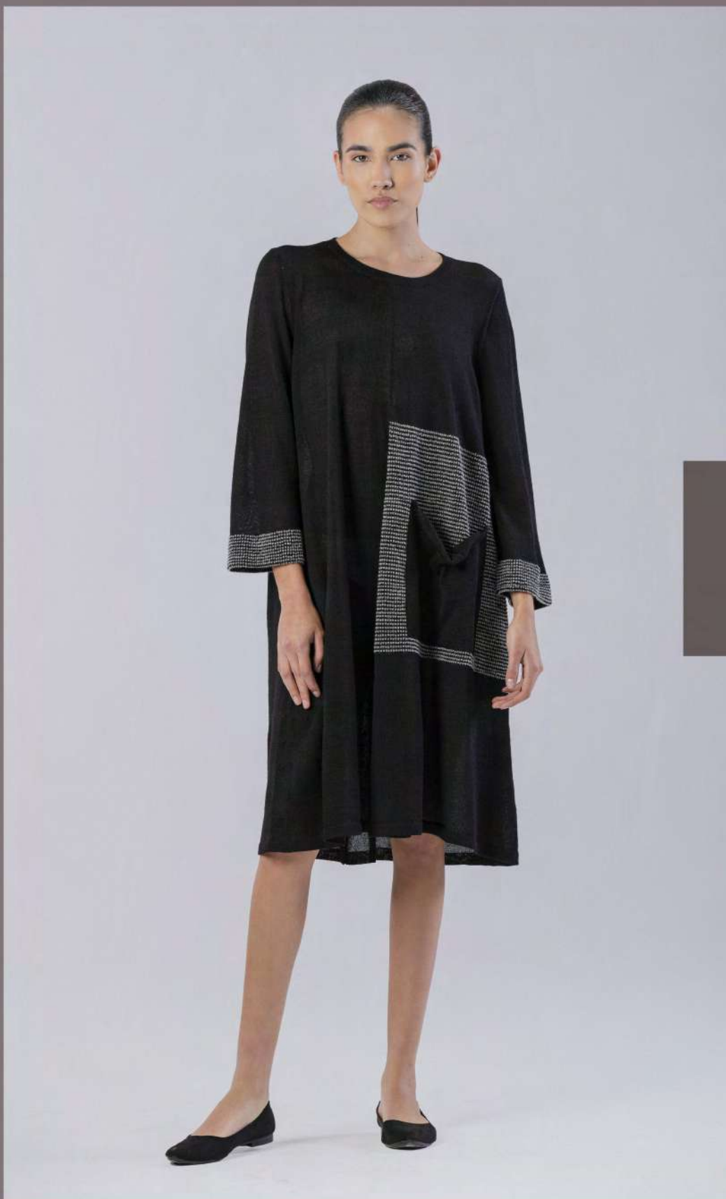
Dress CATALINA PM2215