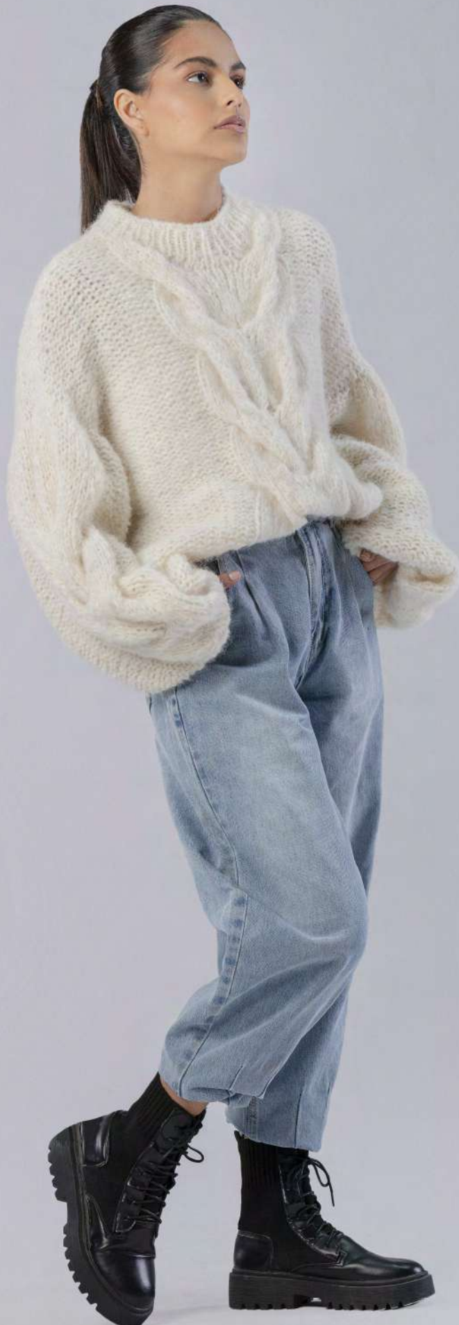
Sweater DANNA PM2219