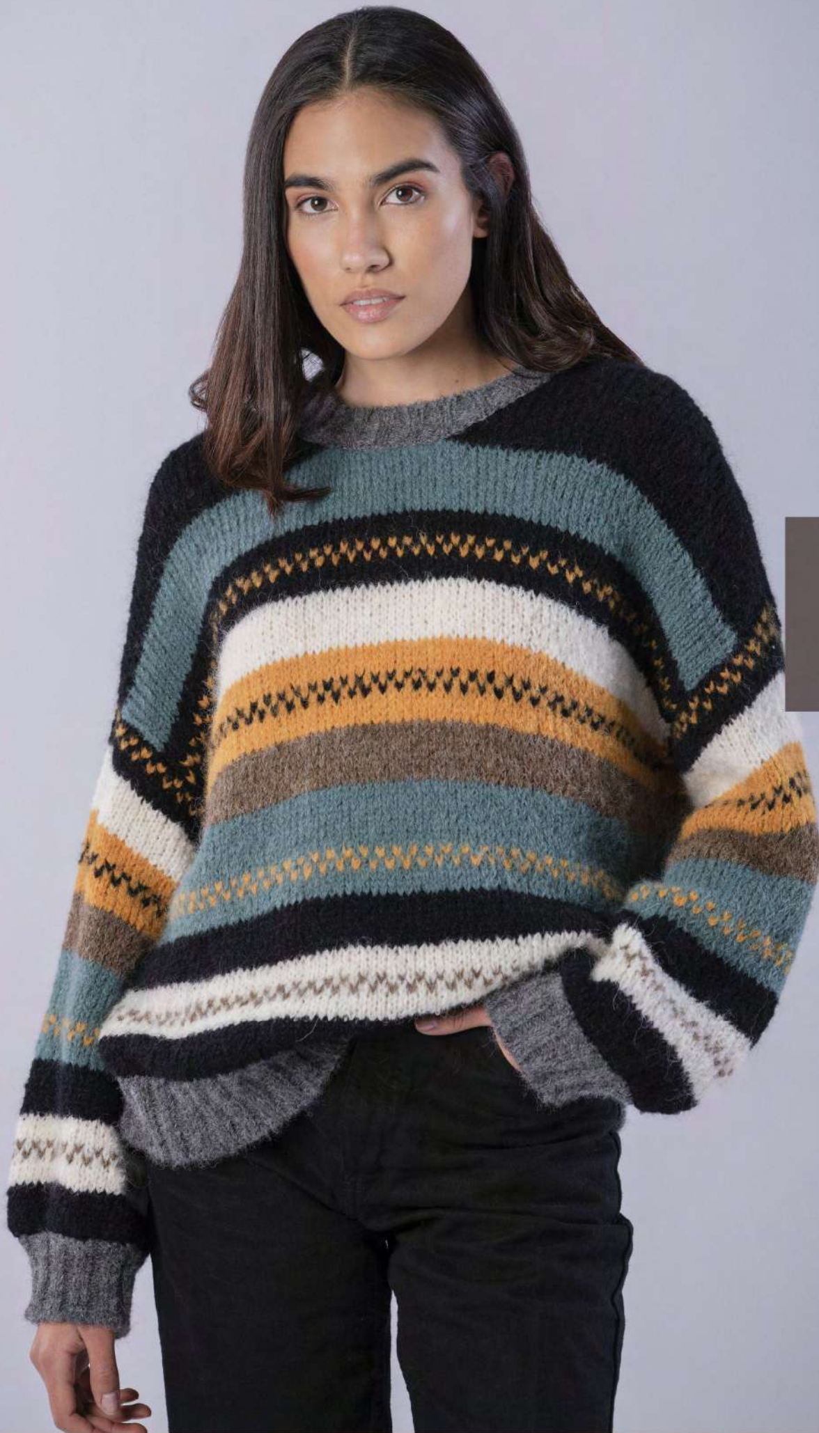
Sweater LAURA PM2233