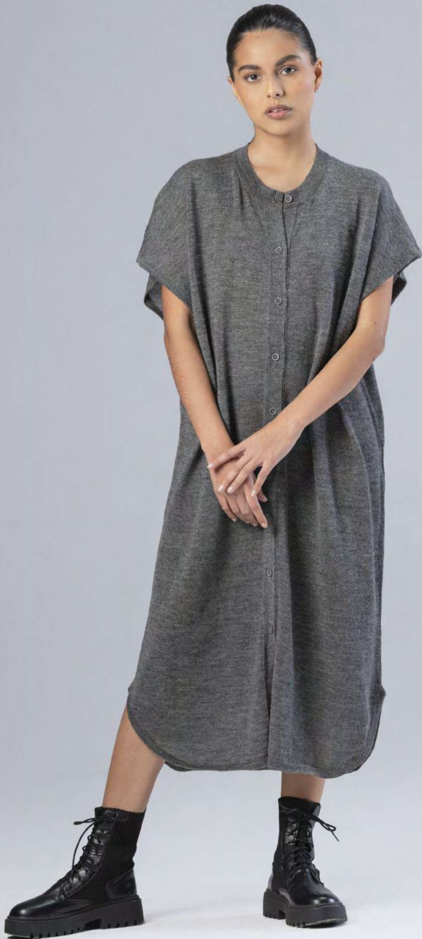
Dress PAMELLA PM2207