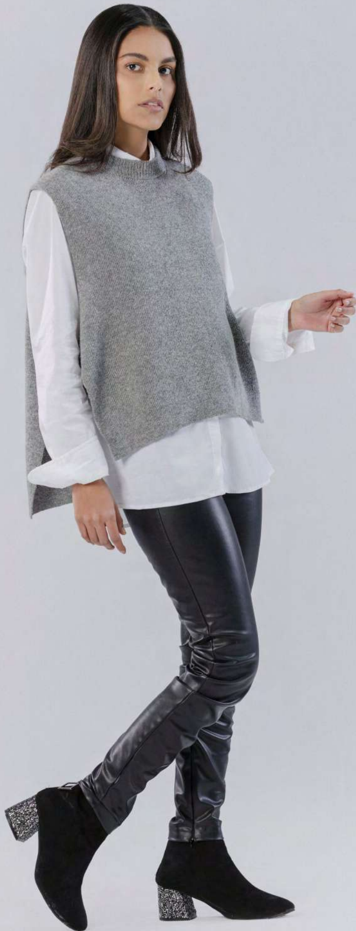
Vest PAULA PM2225