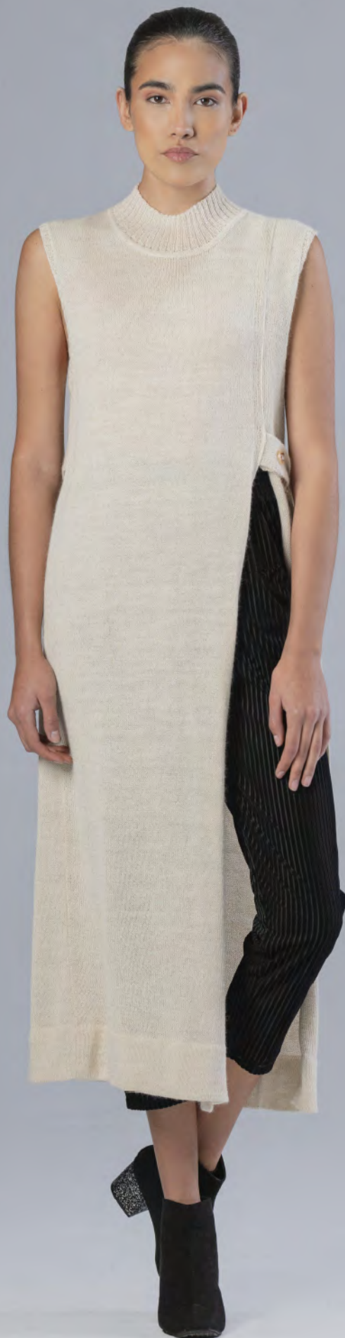
Tunic MALVA PM2204