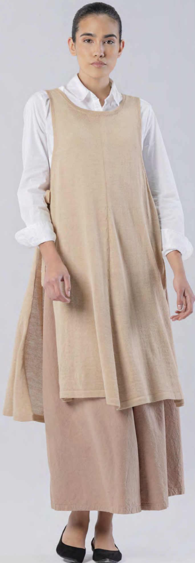
Tunic JESSEY PM2217