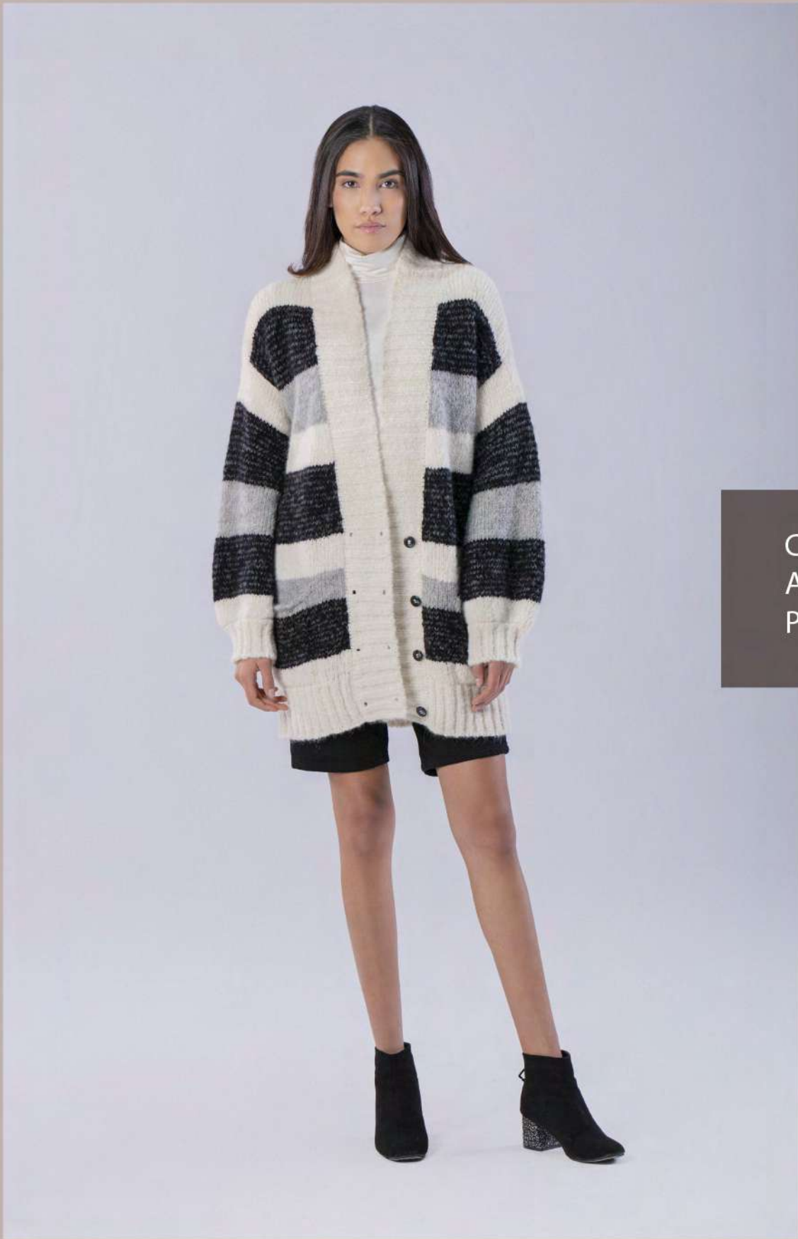
Cardigan ANGIE PM2235