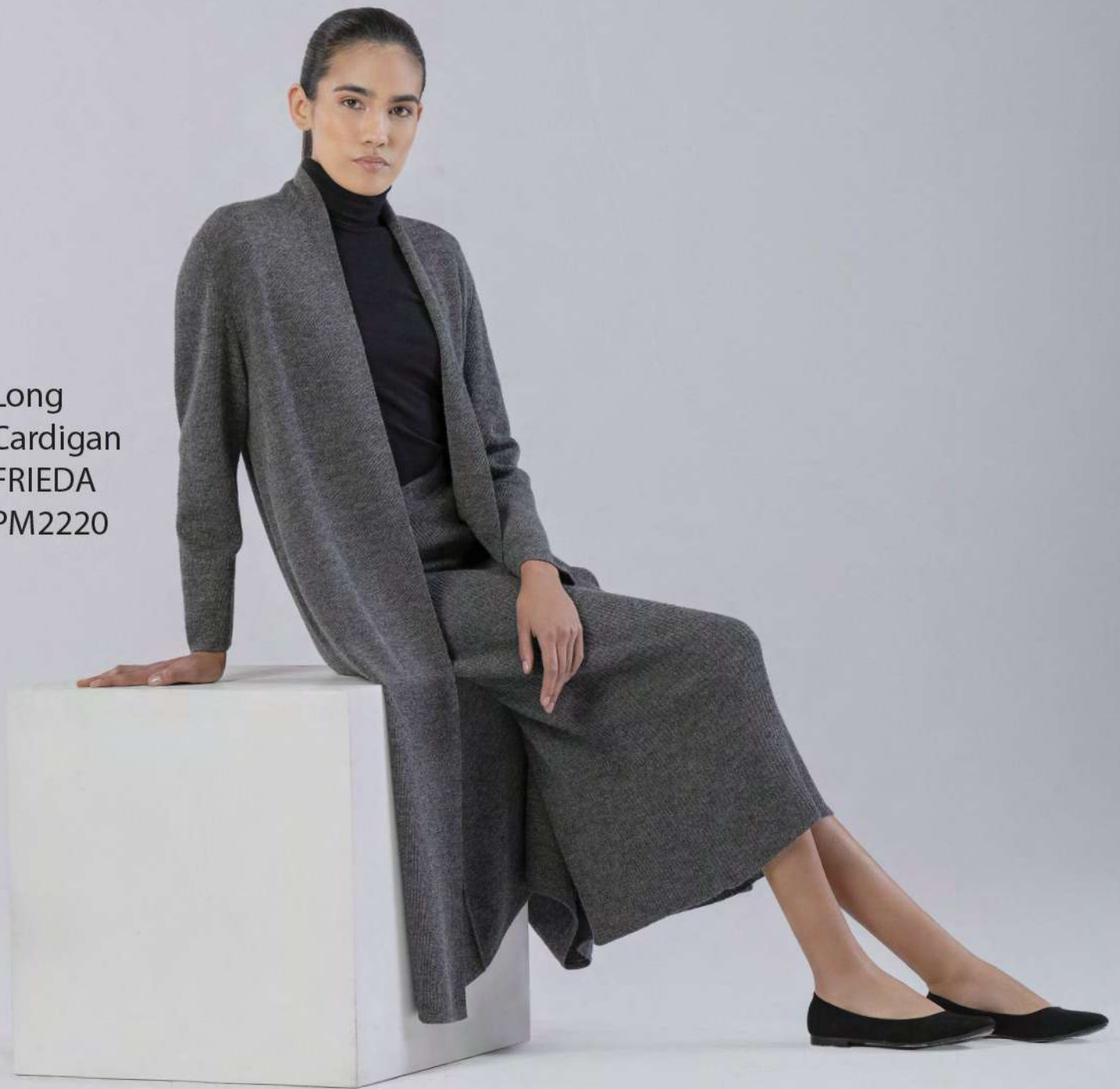
Long Cardigan FRIEDA PM2220