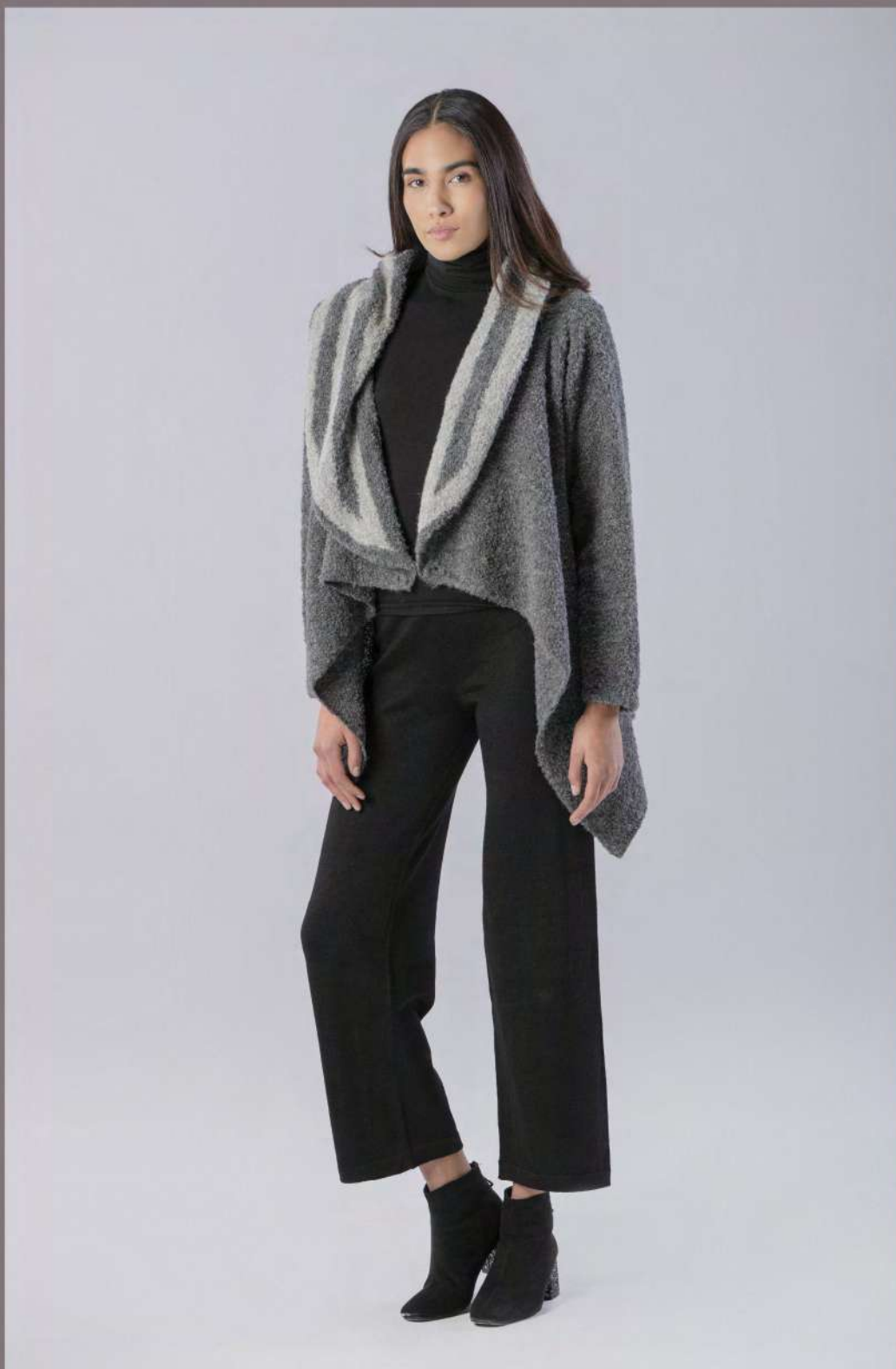
Cardigan HANNA PM2236