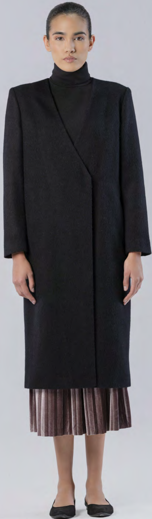
Coat DALIHA PM2213