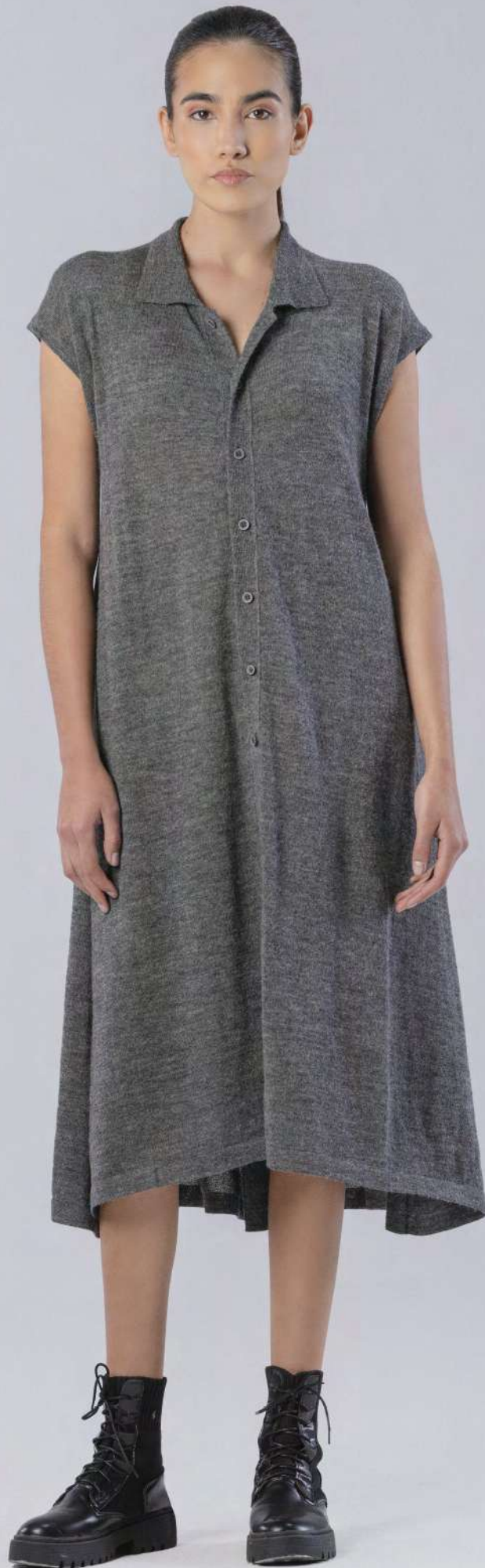
Dress FRESSIA PM2211