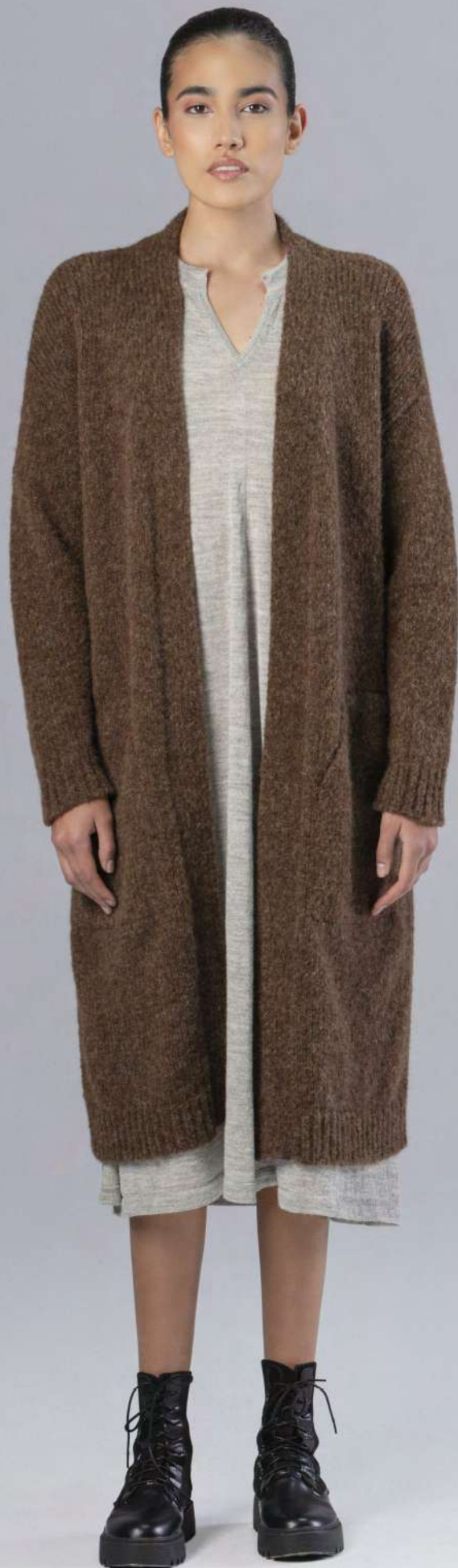
Long Cardigan DREW PM2206