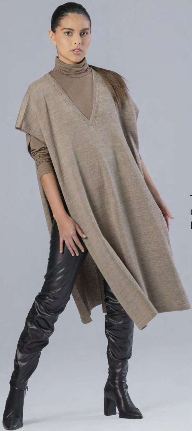
Tunic CLARA PM2209