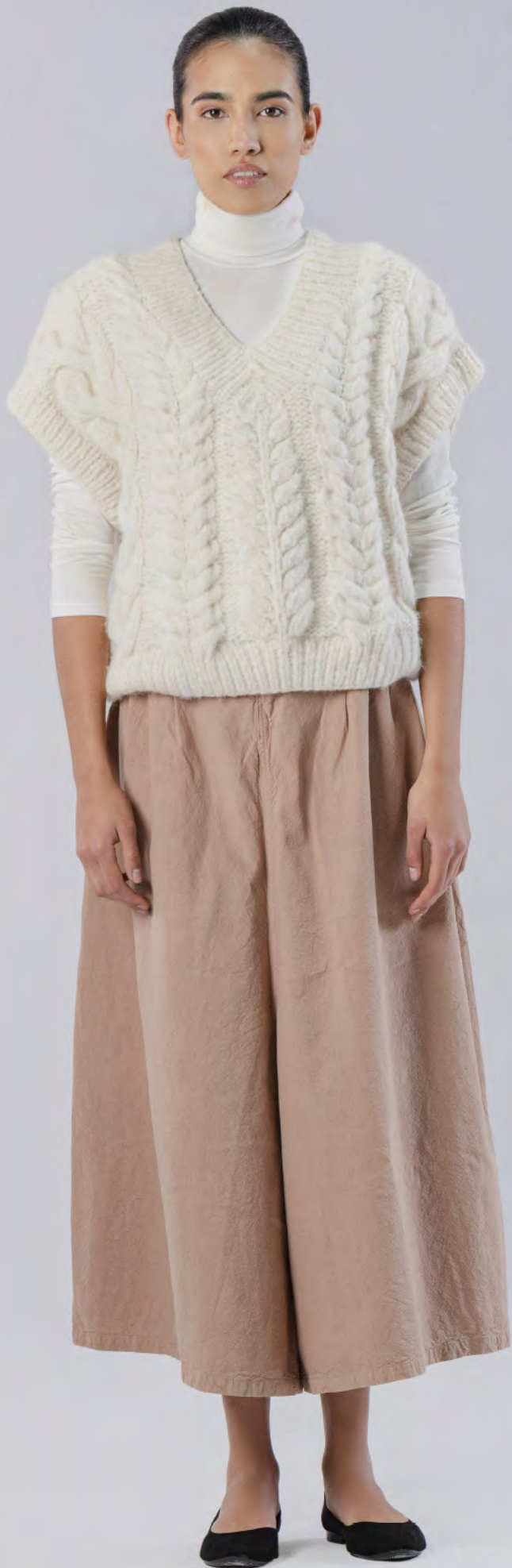
Vest ALONDRA PM2223