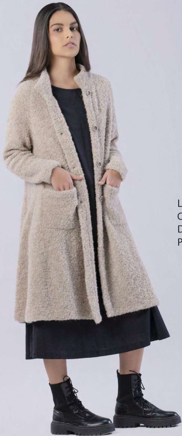
Long Cardigan DANIELLE PM2229