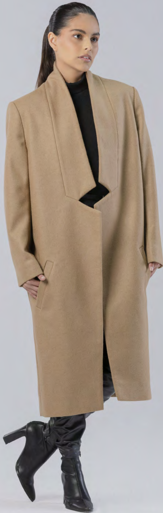
Coat TRISSA PM2212