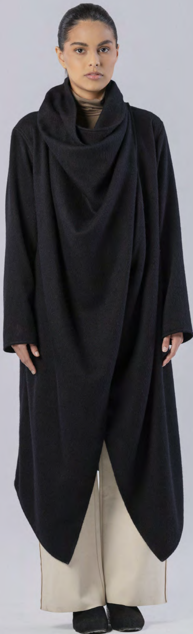
Coat MIRANDA PM2216