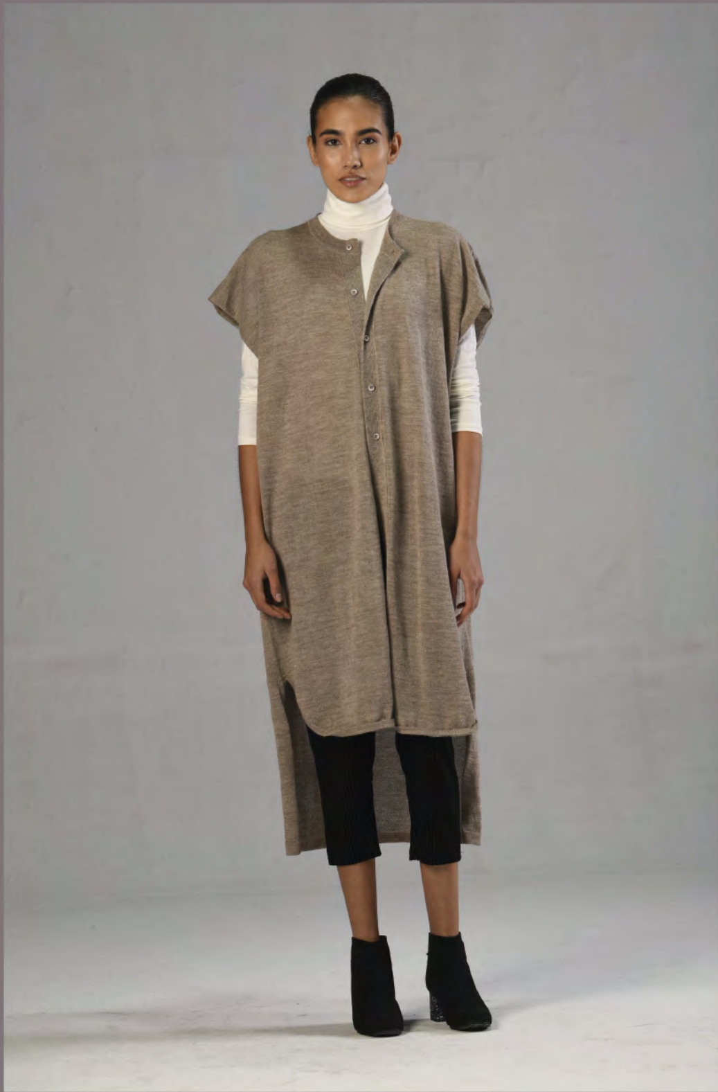
Tunic Dress LORENA PM2210